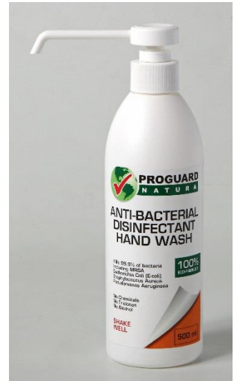
500 ml (long nose)

No Chemicals - No Alcohol - No Triclosan